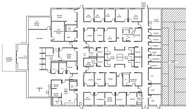
One Story Building